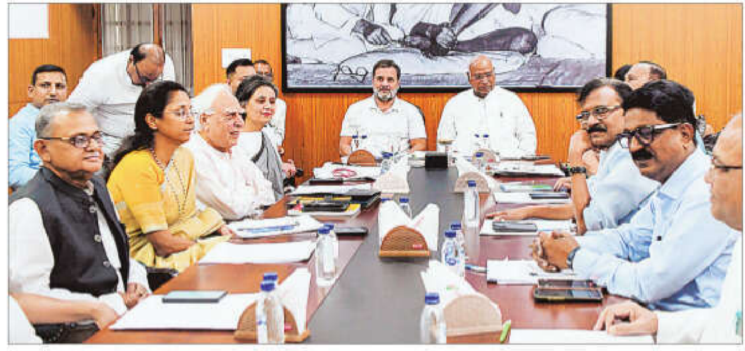
Congress president Mallikarjun Kharge and Leader of the Opposition Rahul Gandhi with MP Kapil Sibal, NCP-SP's Supriya Sule, TMC's Sagarika Ghose, Shiv Sena (UBT)'s Sanjay Raut, and other INDIA bloc leaders during a meeting, in New Delhi on Wednesday

The sources said this is what the Union home minister has said in public so far, and it will deflate the Opposition's criticism that southern states will have a lesser voice in Lok Sabha.