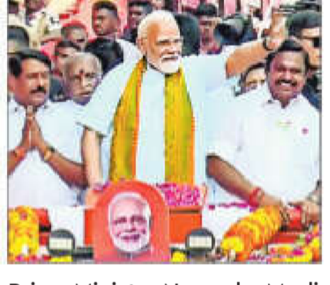
Prime Minister Narendra Modi during a roadshow in Nagercoil, Kanyakumari

PRESS TRUST OF INDIA Nagercoil, Tamil Nadu, Apr 15