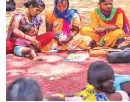
The state will go to the polls later this year. Of the 54 million voters in the state. 26 million are women

Apart from this, 'Mukhyamantri Balika Scooty scheme' has been announced, under which the government will give e-scooties to girl students, who get first class in higher secondary examinations. Although, the amount of women and building a self-reliant set aside for this has not been announced. In Madhya Pradesh.