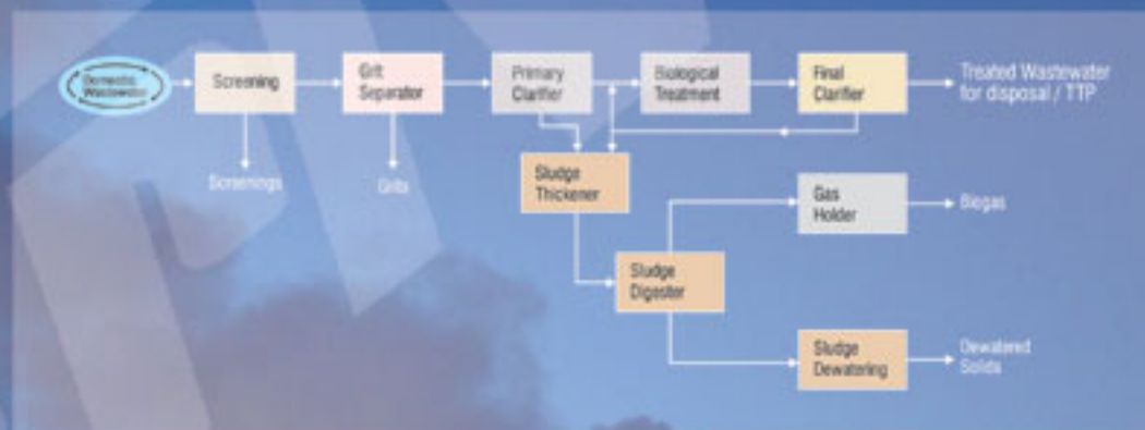
A typical Municipal wastewater treatment system